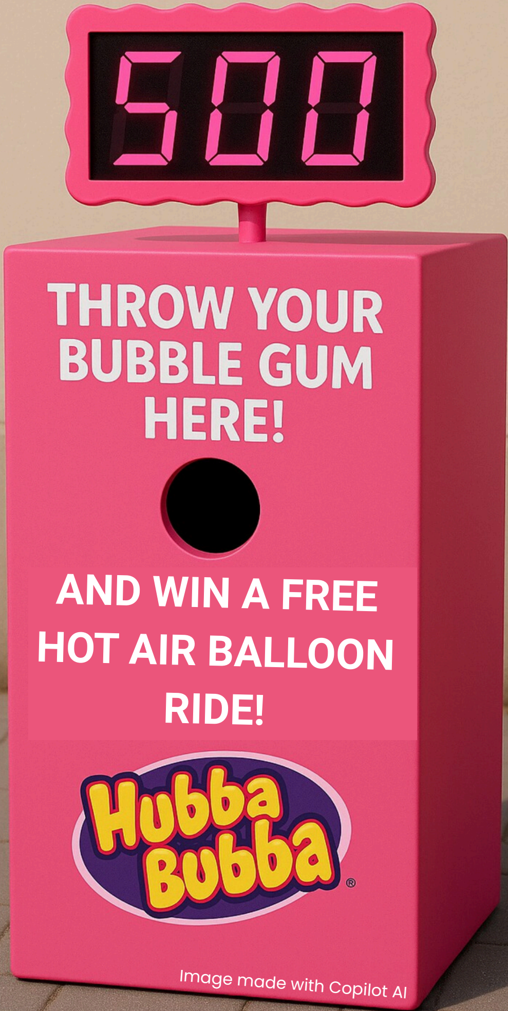
Image made with Copilot AI